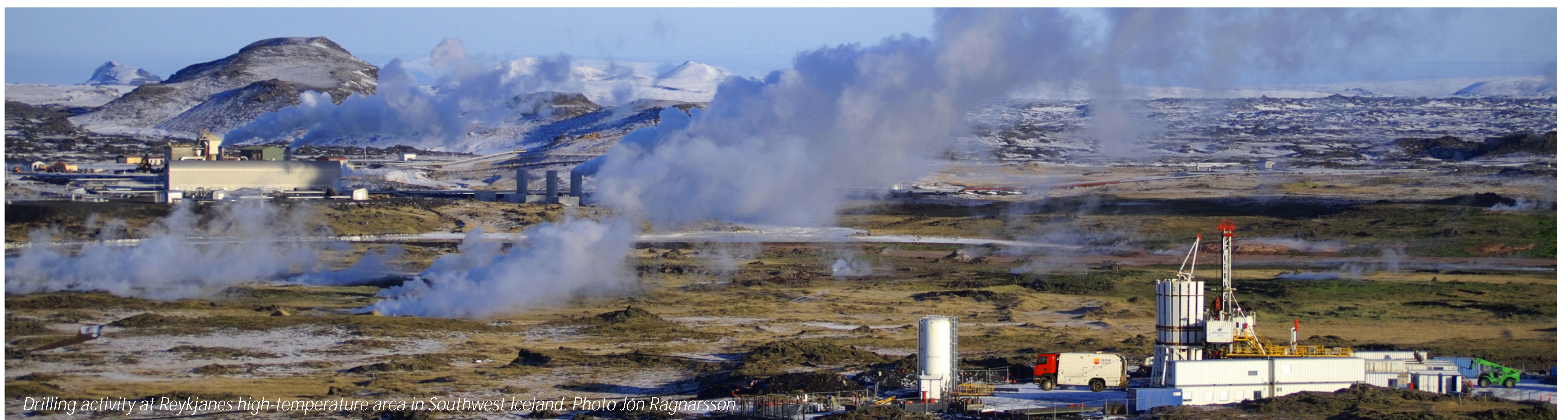
Drilling activity at Reykjanes high-temperature area in Southwest Iceland.