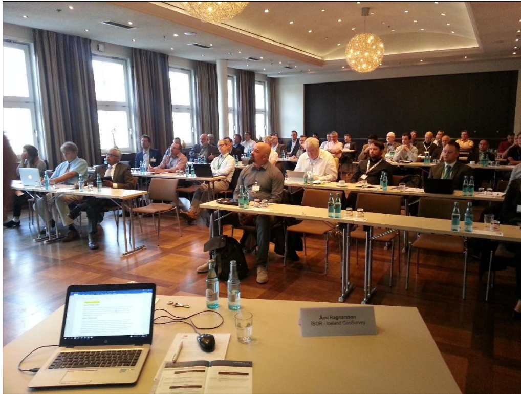
Figure 3. Participants in the GeoWell session at the Celle Drilling 2017 conference.